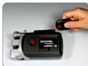
Register of Remote Key