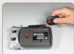
Register remote control